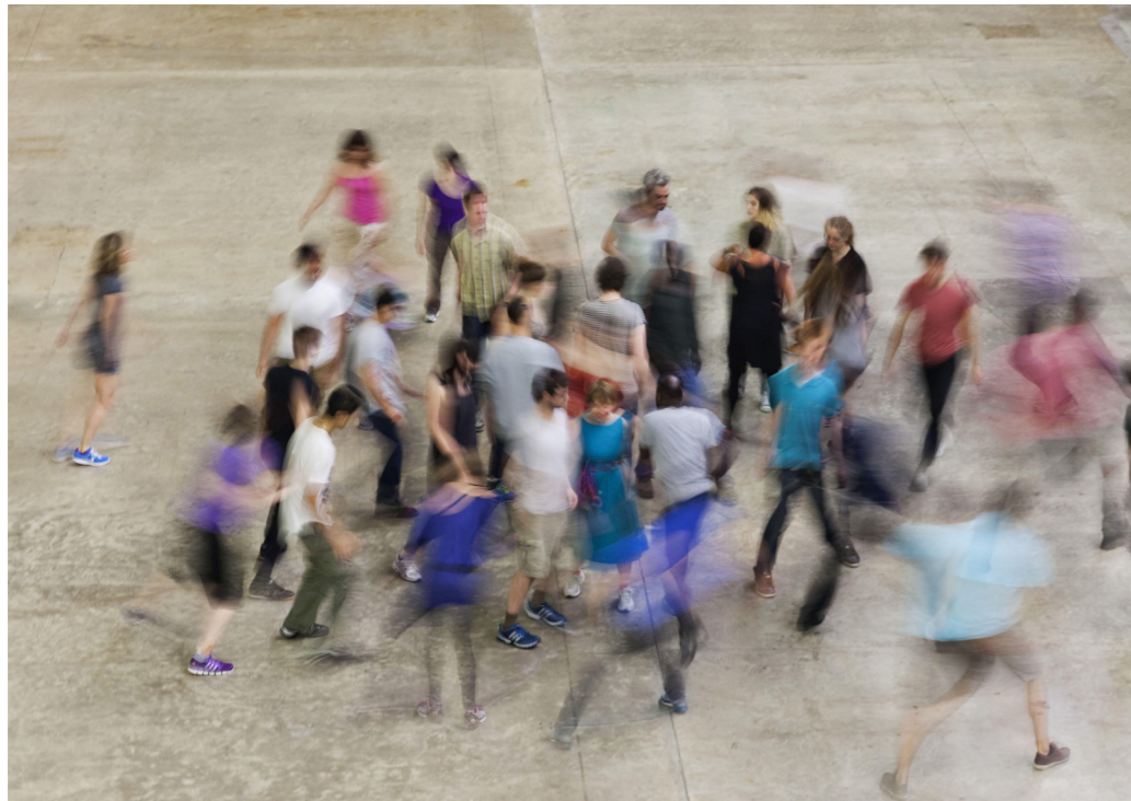
Tino Sehgal's Tate Modern installation 'These Associations', 2012

To do this, we will learn from theatrical performance space architecture. Performance space is by its very nature, makeshift and provisional; and we are inspired by its capacity for constant reinvention to host new events and remain relevant. Through improvisation, artists, companies, and directors exploit overlooked and undervalued spaces and creatively transform them in unselfconscious and imaginative ways. We are interested in the “energy transfer” within these spaces that connects the energy of artists with audiences, and back out to the wider city.